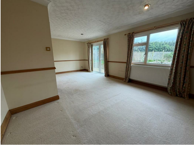
Double glazed window. Double glazed patio doors to rear. Two radiators.