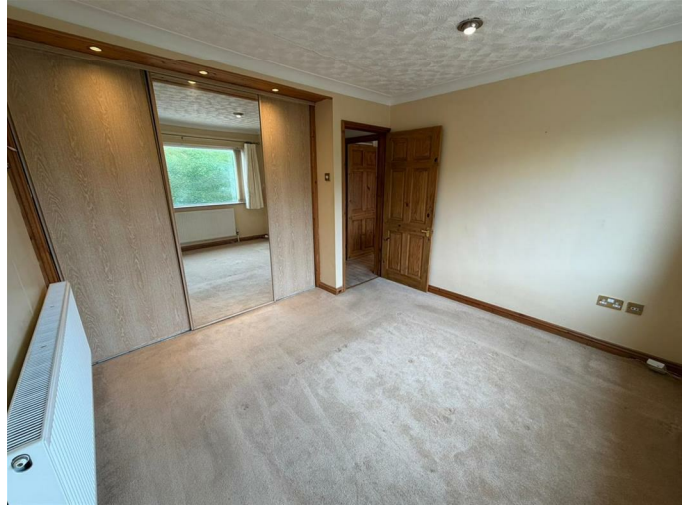
Double glazed window. Two radiators. Fitted wardrobes.