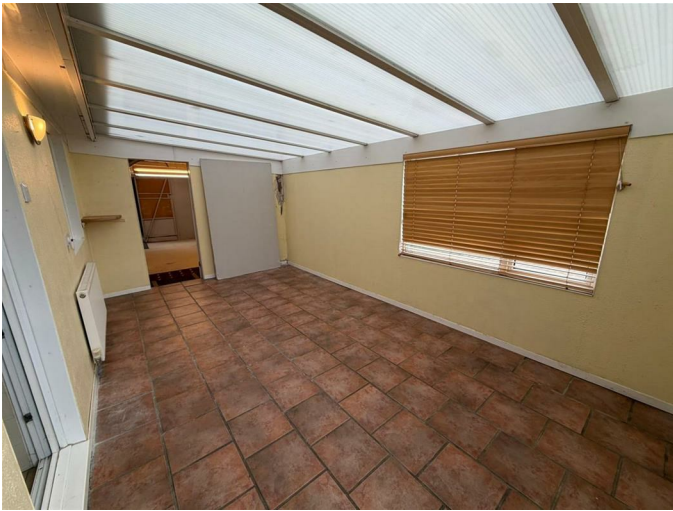
Perspex roof. Door to side. Tiled flooring.