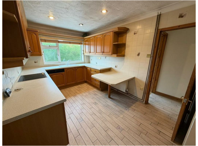
Double glazed window. Matching range of base and wall units with roll edge work top. Sink unit with mixer tap over. Built-in oven with electric hob and extractor over. Integrated dishwasher and fridge. Tiled flooring.